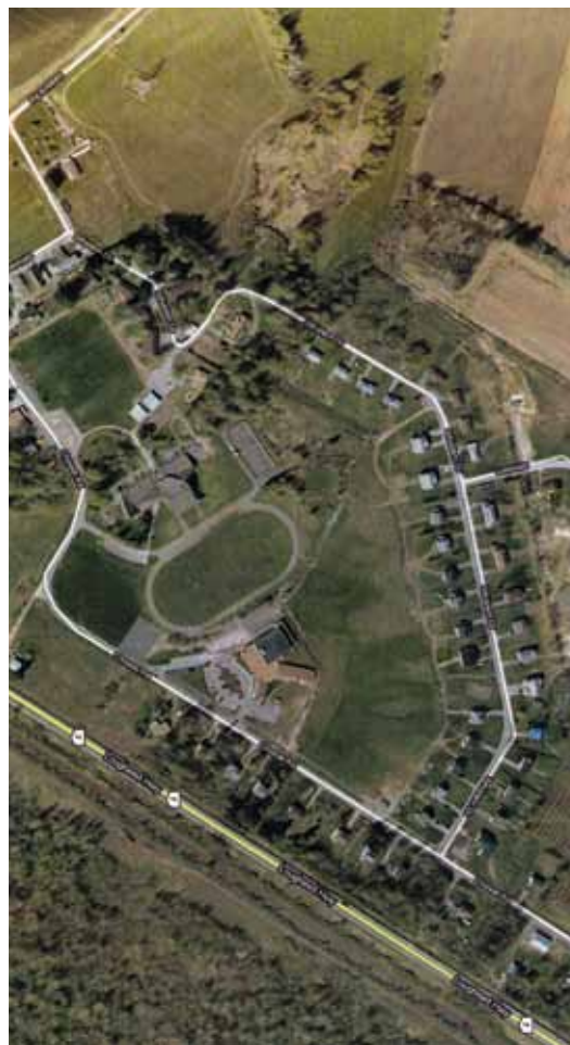
Aerial view of Seabird Island First Nation, BC

Seabird Island First Nation exists to promote a healthier, self-sufficient, self-governing, unified and educated community. Its decisions are guided by a commitment to realize Vision 2020, a strategic multi-year plan to achieve physical, emotional, mental, spiritual and cultural balance for all members of the community.