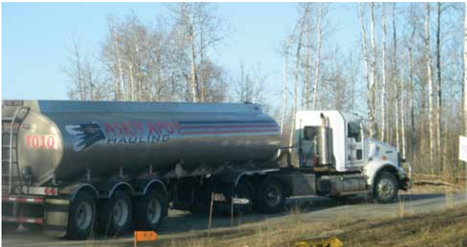
Onion Lake Cree Nation, SK

In addition to partnering with the Fund, Onion Lake has made the commitment to assist members in home renovations and mortgaging homes. As well, OLCN is assisting members wishing to become homeowners by making a capital contribution toward establishing a Home Mortgage Trust and by granting a portion of the down payment for members who qualify for loans through a private lender program.