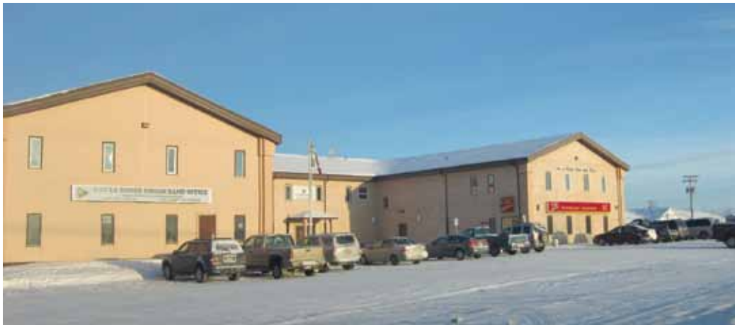
Band office in Lac La Ronge, SK

Lac La Ronge has a history of innovative programming and economic development successes that continue to provide opportunities for their members today. Kitsaki Management owns and has investments in several companies and strives to employ band members. In 2004/05, Lac La Ronge received national recognition after it developed and began operating the first formal on-reserve home ownership program in Saskatchewan. The communities are proud of their heritage and Cree language and of the educational opportunities and social development work made possible by many years of strong leadership.