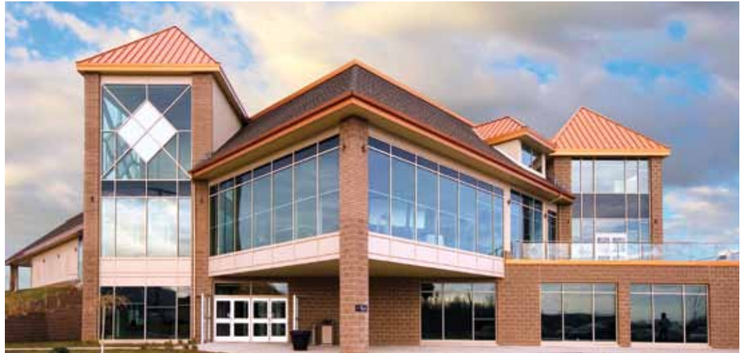
Membertou Trade and Convention Centre, NS